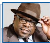
CEDRIC THE ENTERTAINER