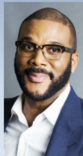
Tyler Perry Actor and Filmmaker

Mark your calendar for two hot events this month: The 2018 NABJ Annual Convention & Career Fair and the National Urban League Conference.