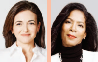
Sheryl Sandberg Judy Smith

8/01/18-8/04/18 Columbus, OH www.nul.org