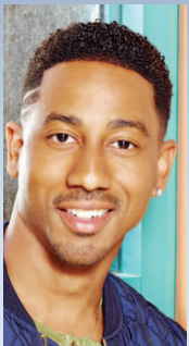
Brandon T. Jackson Comedian and Actor