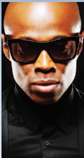
Kem , Motown Recording Artist with Special Guest Tamar Braxton