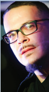
Shaun King , Journalist, Humanitarian and Activist