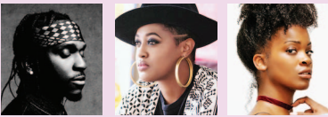
Pusha T Rapsody Ari Lennox