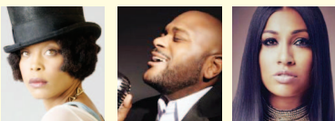
Erykah Badu Ruben Studdard Melanie Fiona

September 1-3, 2017 Dallas, TX tbaalriverfrontjazzfestival.org