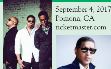
Boyz II Men Kenny Babyface Edmonds

September 4, 2017 Pomona, CA ticketmaster.com