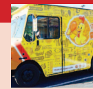
The Rolling Rooster

September 30, 2017 Austin, TX soulfoodtruckfest.com